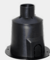
Recessed Sleeve A07